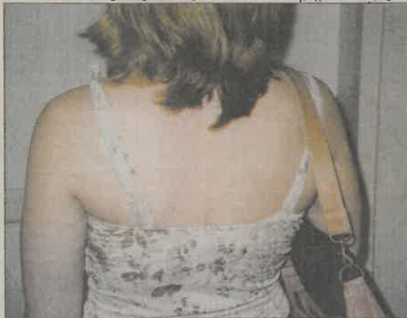
T-shirts displaying drug or alcohol references and tanktops, as seen above, are not allowed according to school regulations

have done in the past. This change is due to the new enforcement of our dress code put into action by the Somerset School Committee and other administrators. When asked what her thoughts were (Please continue on page 2)