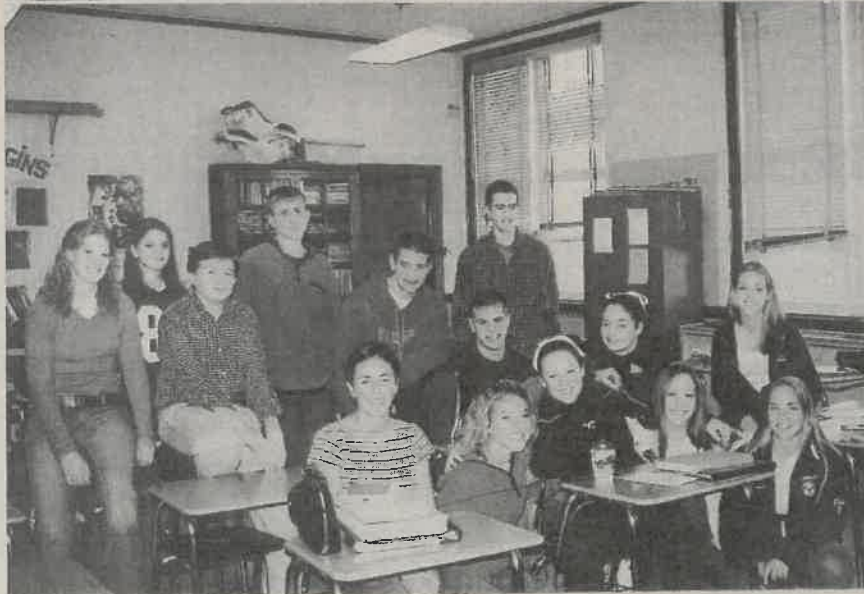
Student Council getting ready for Case Rally

Learn something about another culture. Try to at least accept other cultural customs as just different and not weird. With these simple things, maybe we can get rid of the negative image of Americans and help promote a positive one. We should strive to create images where Americans are seen as understanding and welcoming of differences.