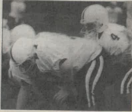
SHS teams practice hard in preparation for their upcoming games