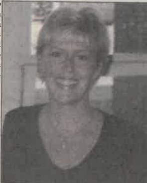
There's a new face in the health department here at Somerset High school